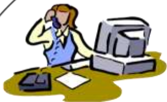
Team Leader (TL)