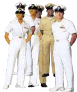
Subject Matter Experts (SMEs)